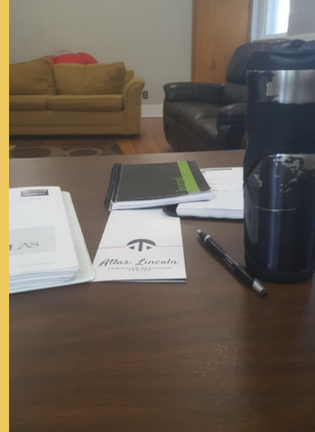
Our first day...